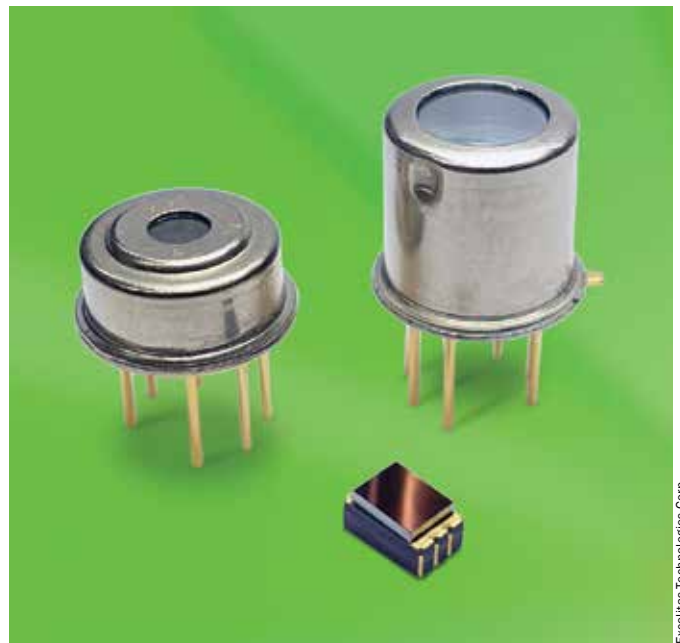
Excelitas Technologies Corp.