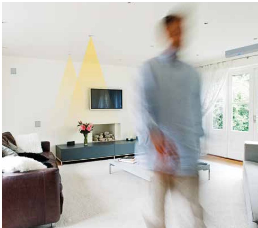
Motion detection is a key component in the advent of smart home products and systems.

As product applications expand, several imperatives have surfaced for meeting the growing sensory needs of smart devices, including miniaturization, software-controlled flexibility, power efficiency, sensitivity enhancements, and ease of integration with product designs. These improvements work together and, in many cases, enable one another.